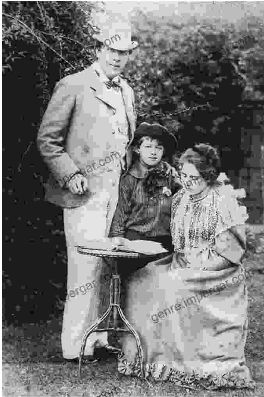
Constance Lloyd: The Enigmatic Muse

Wilde's story unfolds amidst the vibrant literary scene of Dublin in the 1870s. As a young and aspiring poet, he encountered Constance Lloyd, a beautiful and intelligent woman who captivated him with her keen intellect and unconventional spirit. Their courtship was a whirlwind of stolen glances, secret rendezvous, and passionate letters that ignited a fire within Wilde's soul.