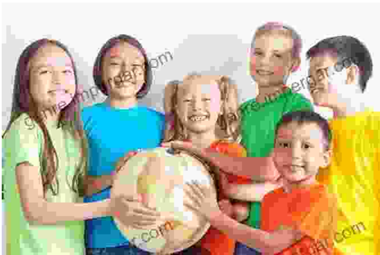
Nurturing Young Minds: An Educational Powerhouse

As children navigate the pages of this captivating book, they will not only expand their vocabulary but also gain valuable insights into the vibrant tapestry of Sinhala culture. From traditional greetings to everyday customs, they will develop a deeper understanding and respect for a different way of life.