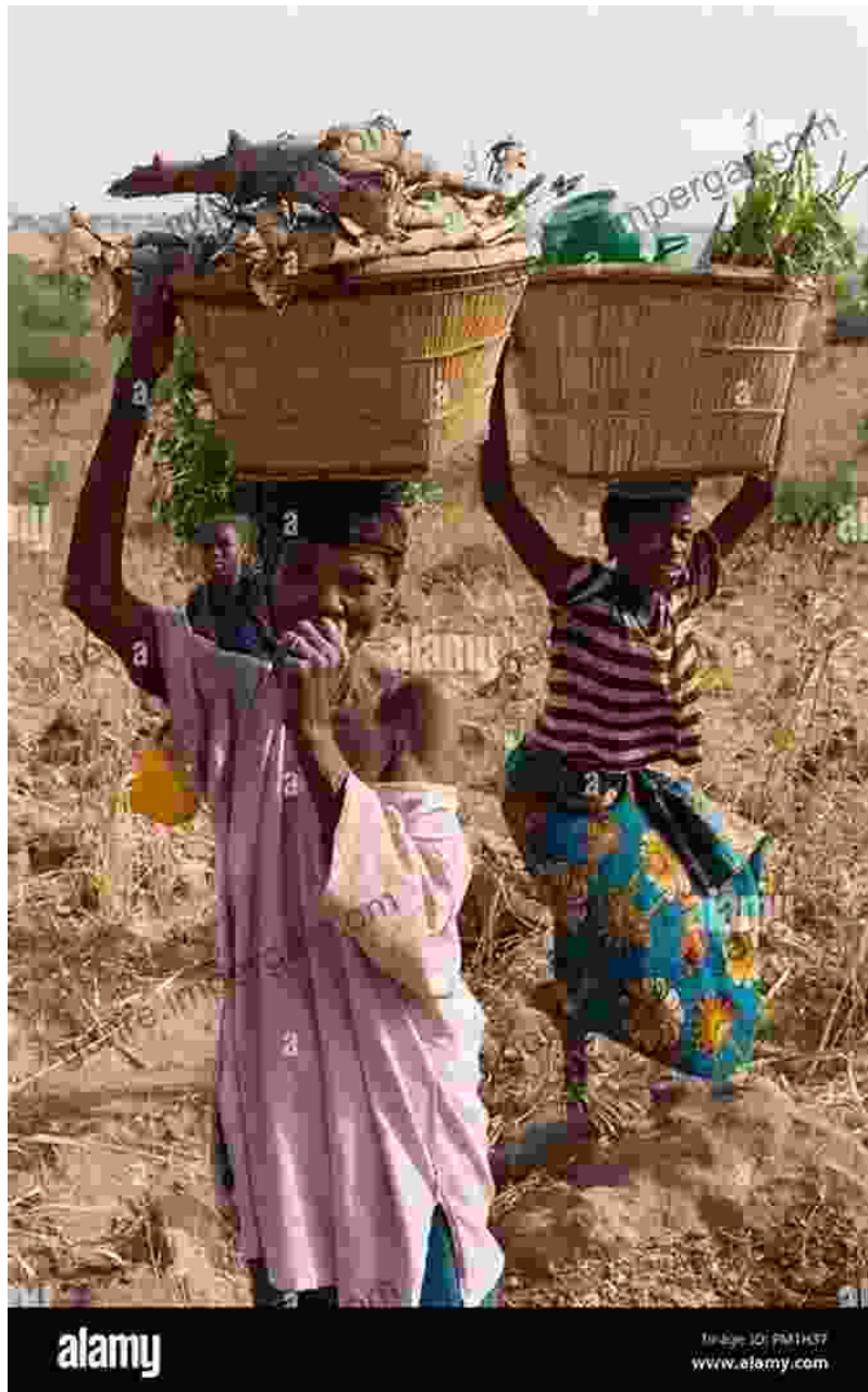
African women carrying baskets of goods in colonial Lagos

The colonial government's policies often reinforced social divisions. Residential segregation, for example, created distinct neighborhoods for Europeans and Africans. The African population was largely concentrated in overcrowded and unsanitary slums, while the European quarters enjoyed spacious homes, gardens, and other amenities.